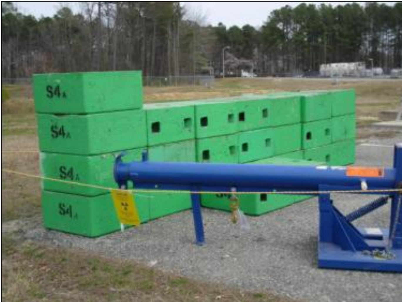
Tagger shielding staged for installation