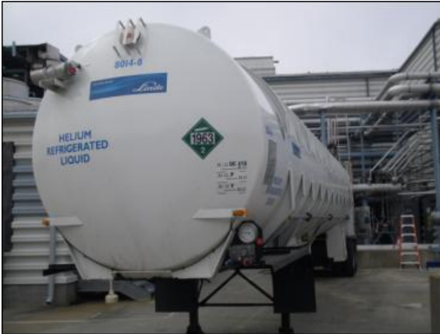
LHe Tank Truck