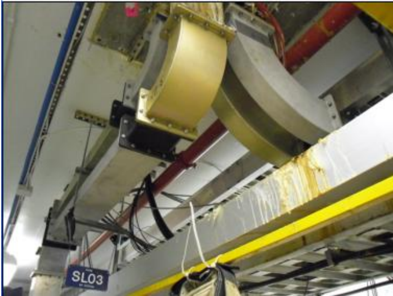
2L03 RF Waveguide reinstalled post-penetration repairs