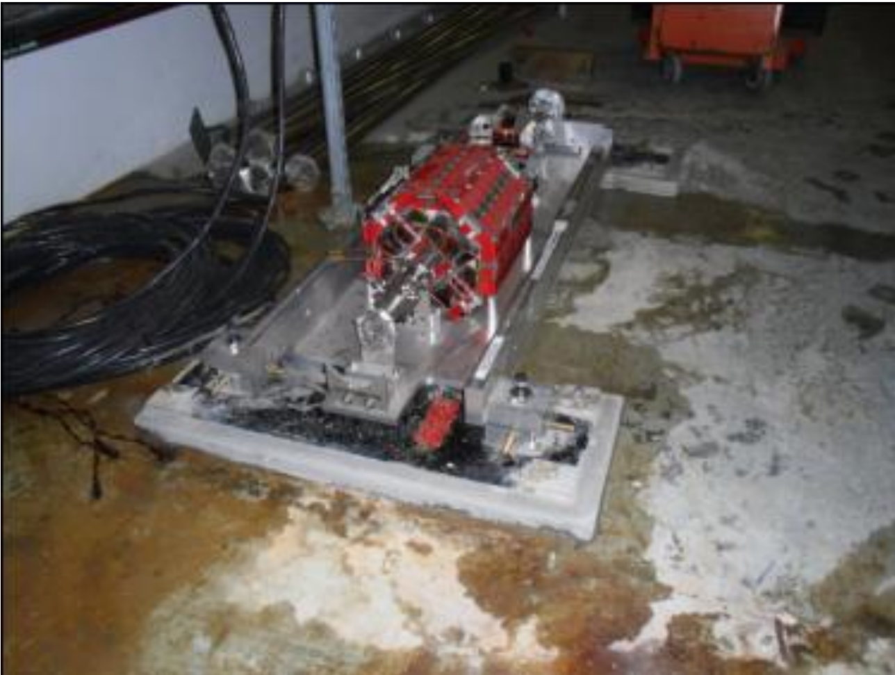
Floor Level Quad Girder in the BT line